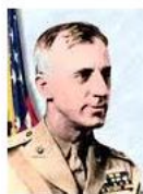
Gen Nathan Mayer Rothschild