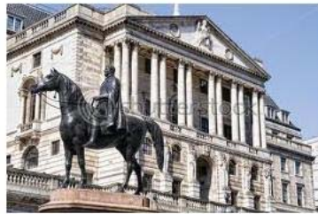
The Bank of England