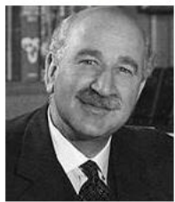
Edmund de Rothschild