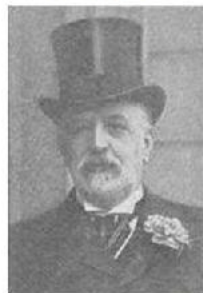
Nathan Mayer Rothschild (1840-1915)

Financier, British Statesman. He became the head of the London branch of the Rothschild banking family, being the great-grandson of family dynasty founder Mayer Amschel Rothschild. He inherited the family baronetcy from his uncle, and became the first Jewish member of Great Britain's House of Lords.