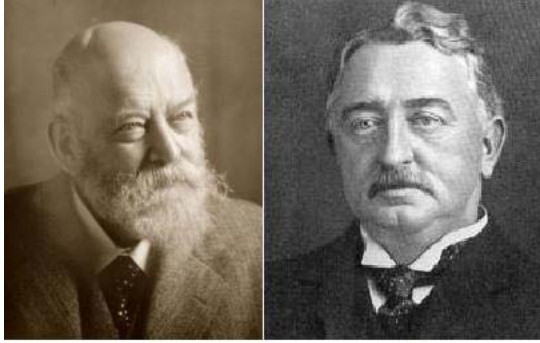
Nathan Mayer Rothschild