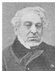
Lionel Nathan de Rothschild