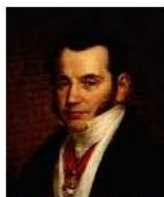
Karl Mayer Rothschild

MAYER AMSCHEL BAUER OPENED a money lending business on Judenstrasse (Jew Street) in Frankfurt Germany in 1750 and changed his name to Rothschild. Mayer Rothschild had five sons.