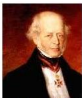
Amschel Mayer Rothschild