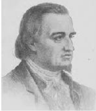
Mayer Amschel Rothschild