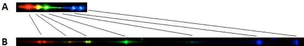
Figure 1. Spectra of streetlights (Mercury vapour lamp) used as reference spectra for wavelength calibration. A. Very low-dispersion spectrum taken in 2007 by Norwegian researchers in Hessdalen using a conventional Canon A-1 reflex camera attached to a 50 mm lens and to some kind of grating (Hauge, 2007). B. Much higher dispersion spectrum taken by this author using a Fujii Finepix S-2 Pro professional reflex digital camera attached to a 70-300 zoom lens and to a ROS (Rainbow Optics Spectroscope) holographic grating (Teodorani, 2008a). The same emission lines are compared together in order to show the big difference in spectral resolution.

A photographic frame containing only the spectrum of interest, elongated by a long used focal length is a more difficult task to reach, but practice shows that such an operation can be quite quickly feasible if the light phenomenon is lasting for a sufficient long time (this happens quite often with earthlights). The result is always good and the spectrum, whatever causes it, can be effectively used for doing science (Teodorani, 2004a; 2004b; 2005; 2008a). A higher resolution spectrum permits a much better pixel-wavelength calibration and consequently a better identification and quantitative analysis on spectral lines, if present. In such a way spectral diagnostic is a sure and safe fact, on which it is really possible to build up a physical interpretation that is able to hold water.